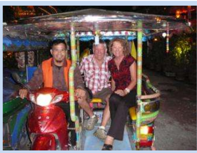
Travelling by Tuk Tuk is always fun!