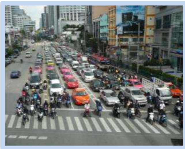
24 /7 the traffic in Bangkok never stops.